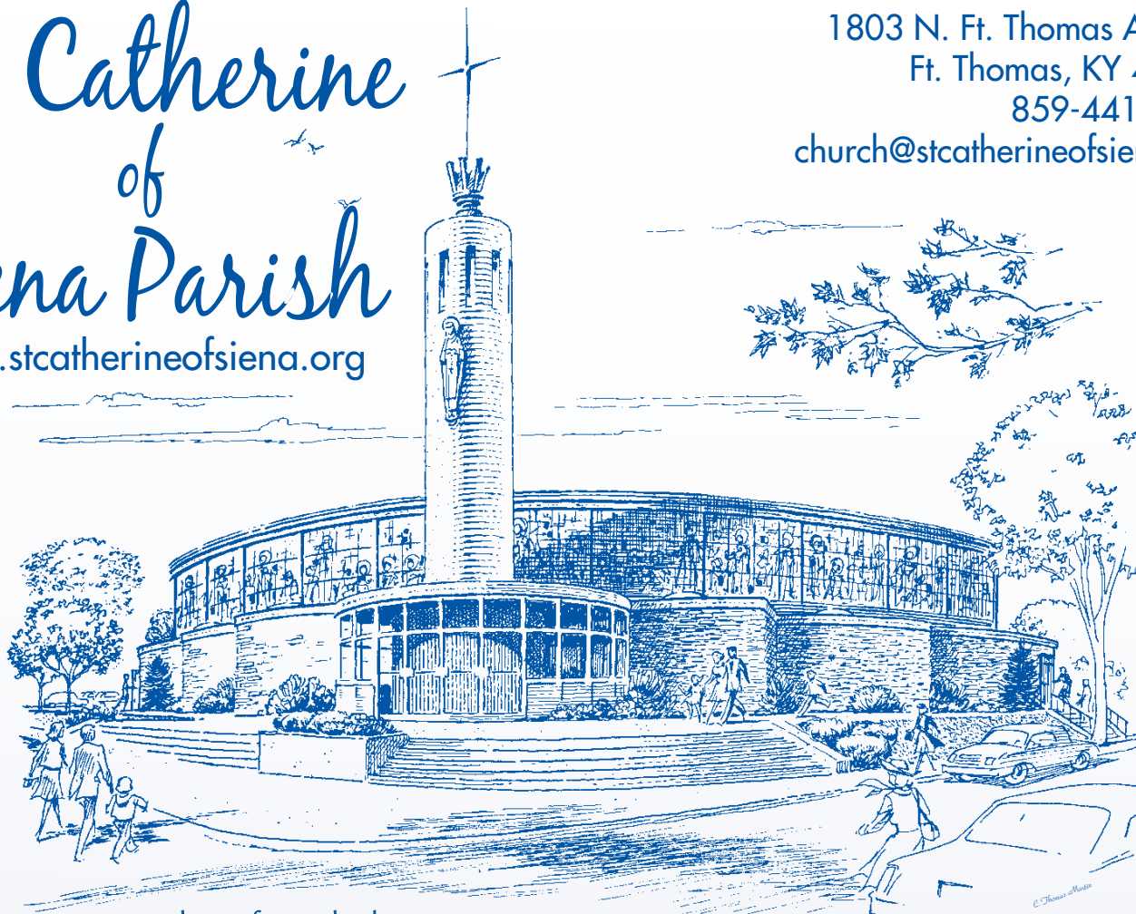
St. Catherine of Siena Church • FORT THOMAS, KENTUCKY

1803 N. Ft. Thomas Avenue Ft. Thomas, KY 41075 859-441-1352 church@stcatherineofsiena.org