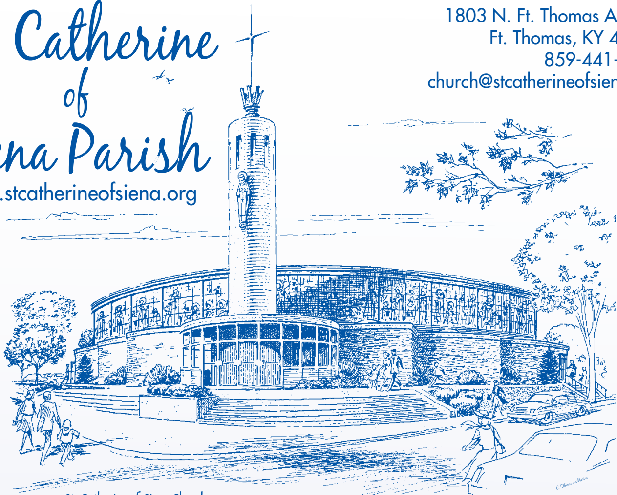
St. Catherine of Siena Church • FORT THOMAS, KENTUCKY

1803 N. Ft. Thomas Avenue Ft. Thomas, KY 41075 859-441-1352 church@stcatherineofsiena.org