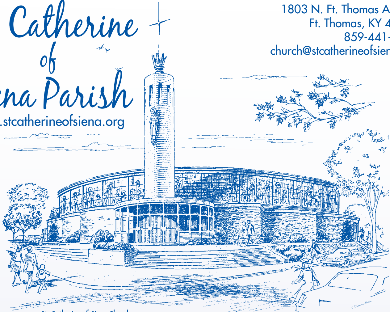
St. Catherine of Siena Church • FORT THOMAS, KENTUCKY

1803 N. Ft. Thomas Avenue Ft. Thomas, KY 41075 859-441-1352 church@stcatherineofsiena.org