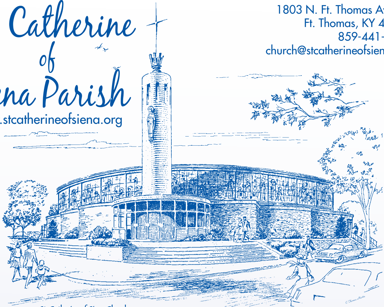
St. Catherine of Siena Church • FORT THOMAS, KENTUCKY

1803 N. Ft. Thomas Avenue Ft. Thomas, KY 41075 859-441-1352 church@stcatherineofsiena.org