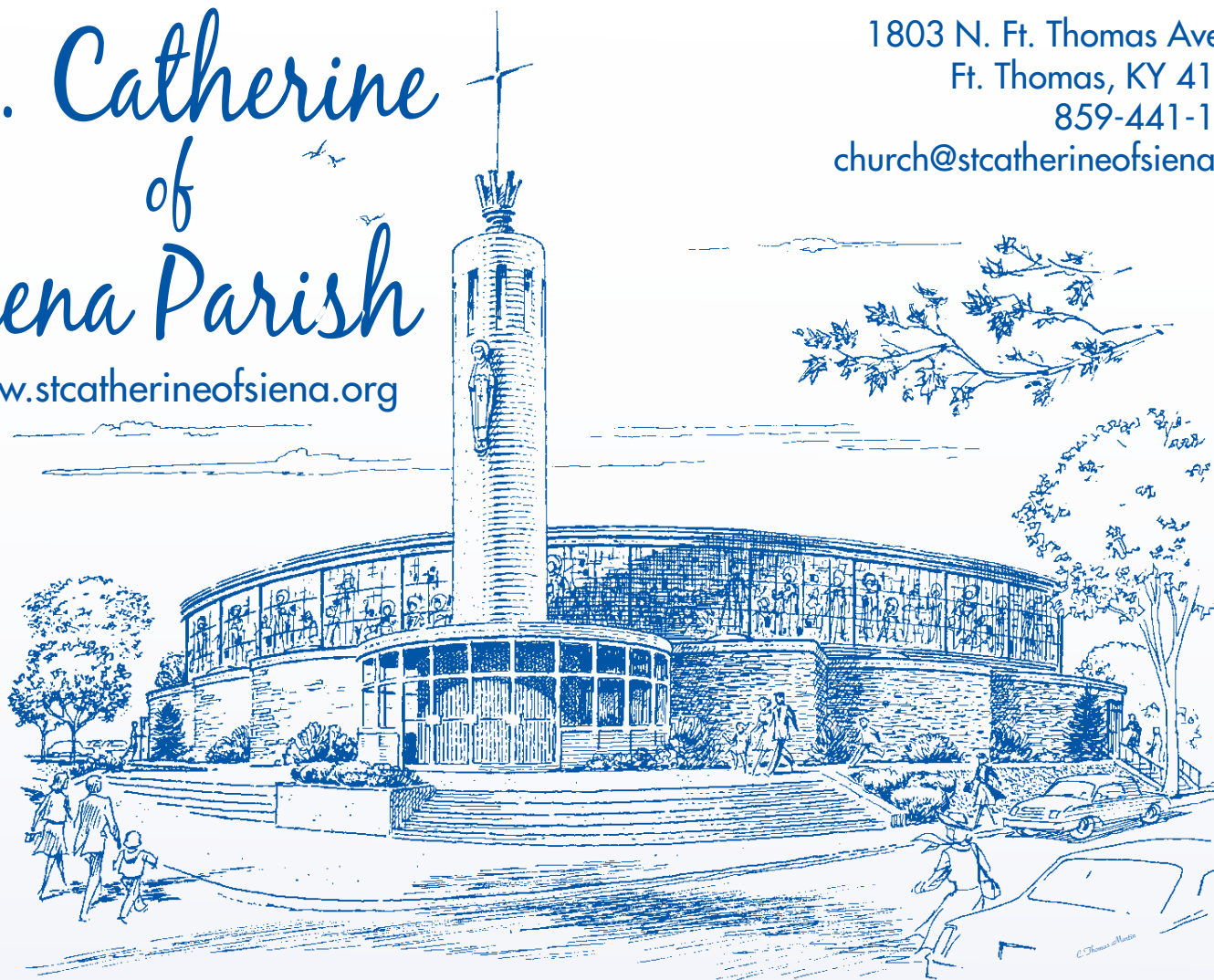
St. Catherine of Siena Church • FORT THOMAS, KENTUCKY

1803 N. Ft. Thomas Avenue Ft. Thomas, KY 41075 859-441-1352 church@stcatherineofsiena.org