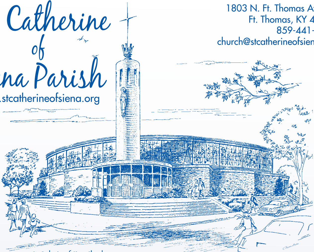
St. Catherine of Siena Church • FORT THOMAS, KENTUCKY

1803 N. Ft. Thomas Avenue Ft. Thomas, KY 41075 859-441-1352 church@stcatherineofsiena.org